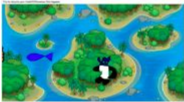
“Save the World!”