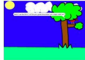
“Change The World”